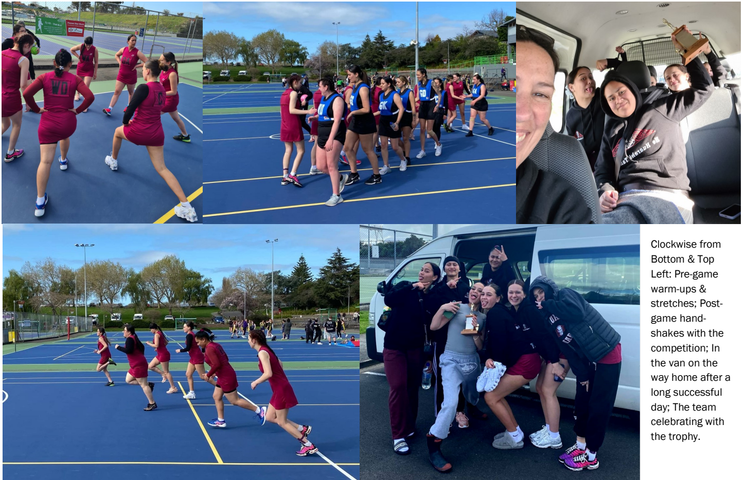
Clockwise from Bottom & Top Left: Pre-game warm-ups & stretches; Post-game handshakes with the competition; In the van on the way home after a long successful day; The team celebrating with the trophy.